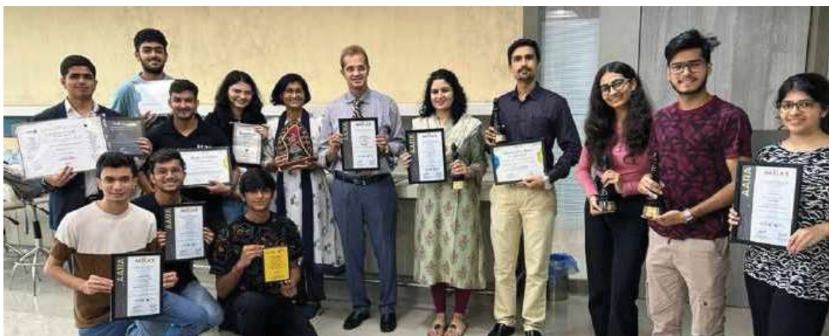
RCNM Students Team with Convener, Vice Principals and Principal